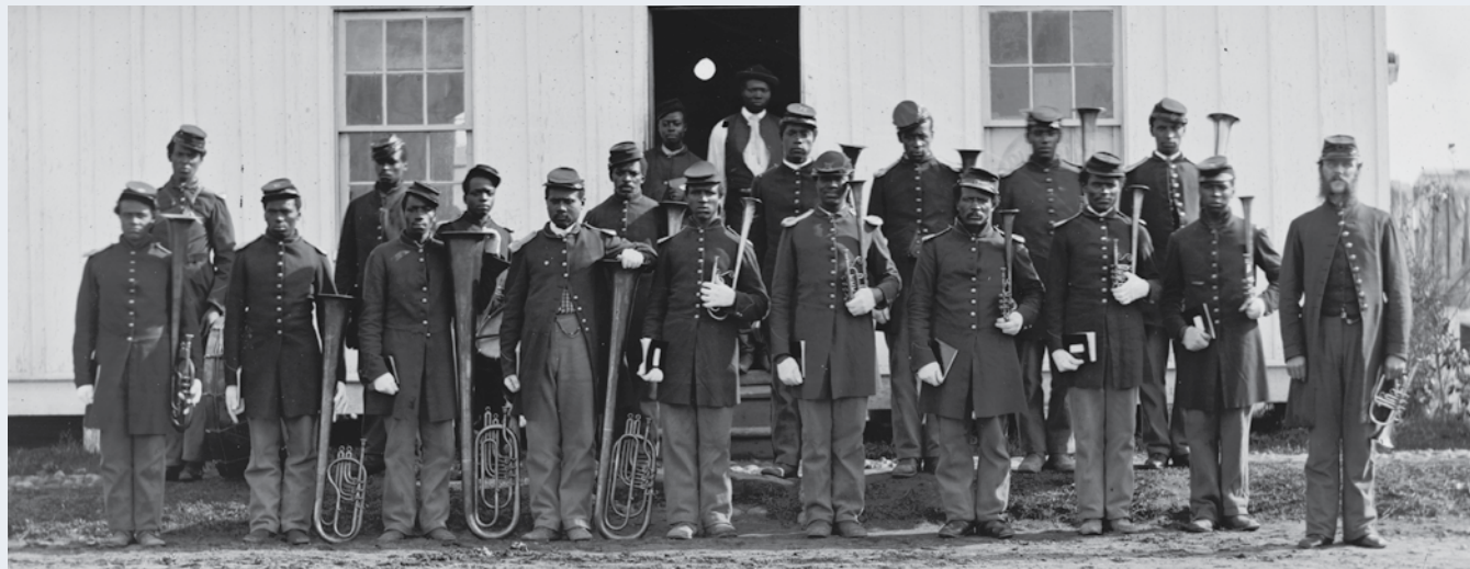
Bureau of Colored Troops photos. Circa 1790-1860.

This is where we get real. Each month, Sticky Wicket takes on a thorny question about a racial, ethnic, cultural or religious issue. These are the hard topics; the stuff that people don't like talking about at work, school or cocktail parties. But these are also the issues we need to explore. To ask your Sticky Wicket question, write: stickywicket@usariseup.com .